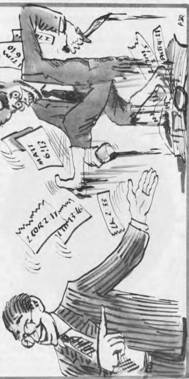
THE REVERENT "BIBLICIST"

"HERE IS THE HEAD OF OUR BIBLE DEPARTMENT! A SCHOLAR AND A GENTLEMAN!"